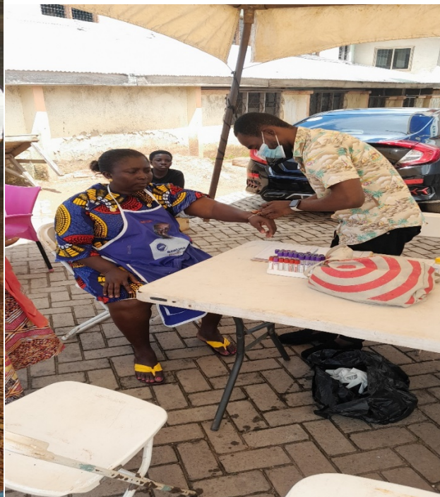
Taking of blood samples of food vendors for screening