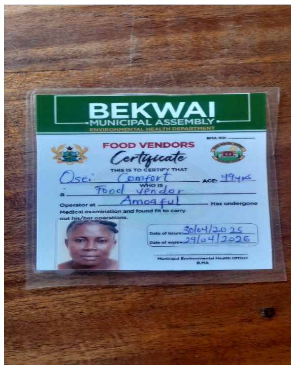
Copies of certificates issued to found fit food vendors